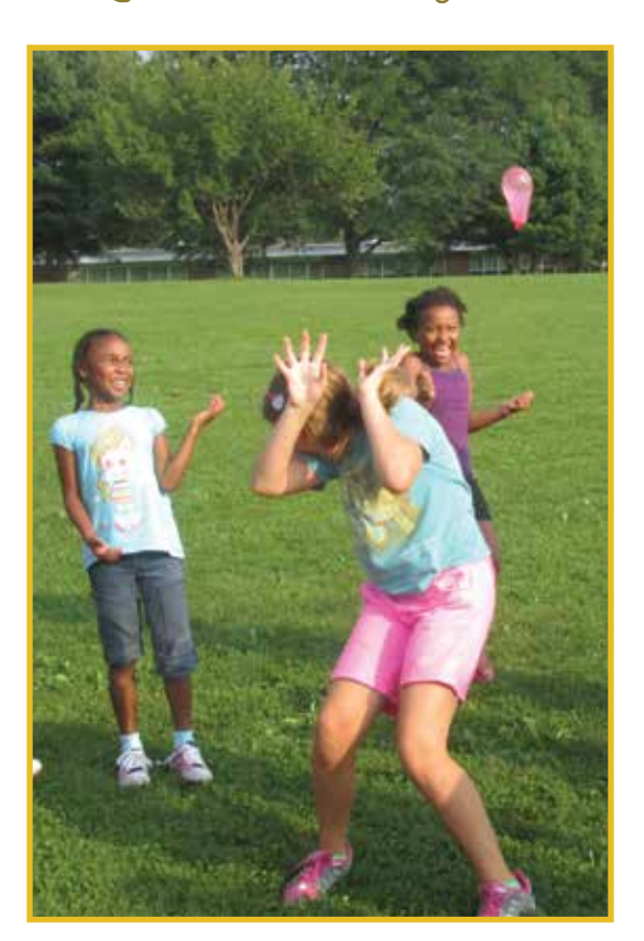
After School Program at Kent Elementary