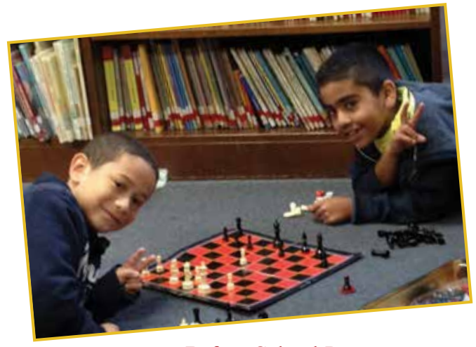
Before School Program at Matthew Paterson Elementary

We are proud to say that we received another award from the Child Care Council of Dutchess and Putnam for Putnam County School Age Program of the Year. Many thanks to our staff, students, and parents for helping to make that possible!