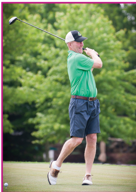
Nice follow through

This year’s Camp Herrlich/Mercedes Benz Golf Invitational was a great success. Thank you so much to the eighty golfers that came out in support of Camp Herrlich back in June. A great time was had by all on the beautiful