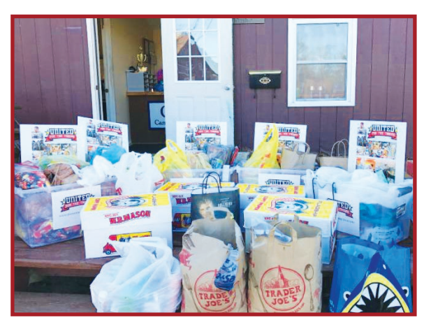
Overflowing bags and boxes

Camp Herrlich's fall community service project was for the United for the Troops' Defend the Holidays Program. This program sends care packages to our troops who are deployed so they can have a taste of home and get some things they "miss most" that will give them comfort while they are away, especially during the holiday season. From October 11th to November 11th, your generosity helped us collect OVER 20 boxes and bags full of donations! We collected snacks, toiletries, and sundries, including leftover Halloween candy, at our Before and After School sites-Kent Elementary, Matthew Paterson Elementary, Pawling Elementary, and Camp Herrlich. We had a wonderful turnout from all of our programs and partners to help make this happen. Many thanks to all our Before and After School Program participants, Carmel Central School District, Pawling Central School District, and Pawling PTO.