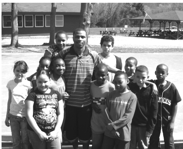
Sebastian Telfair with students from PS 130 on Camp Herrlich's basketball court— April 28, 2009

Current NBA point guard Sebastian Telfair spent a beautiful early spring day walking Camp Herrlich trails and sharing stories with a group of students from PS 130. The students from the Bronx public school were at the camp for an Environmental Education field trip and were the lucky recipients of some very candid personal time with Mr. Telfair. Telfair, a former Lincoln High School (Brooklyn) basketball star, has graciously agreed to support and endorse Camp Herrlich with its future endeavors and spent the day sharing anecdotes and autographs with Herrlich staff and PS 130 campers alike. It is the generosity of individuals like Sebastian Telfair that allows Camp Herrlich to continue its mission.